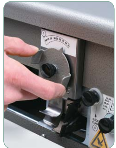
Simple dial adjustments to change from a 6 mm to a 50 mm coil.

Toll Free Order Line: 1.800.665.7884 Toll Free Fax: 1.888.665.7884 Phone: 204.663.9214 Fax: 204.663.7905 Email: info@plastikoil.com Web: www.plastikoil.com